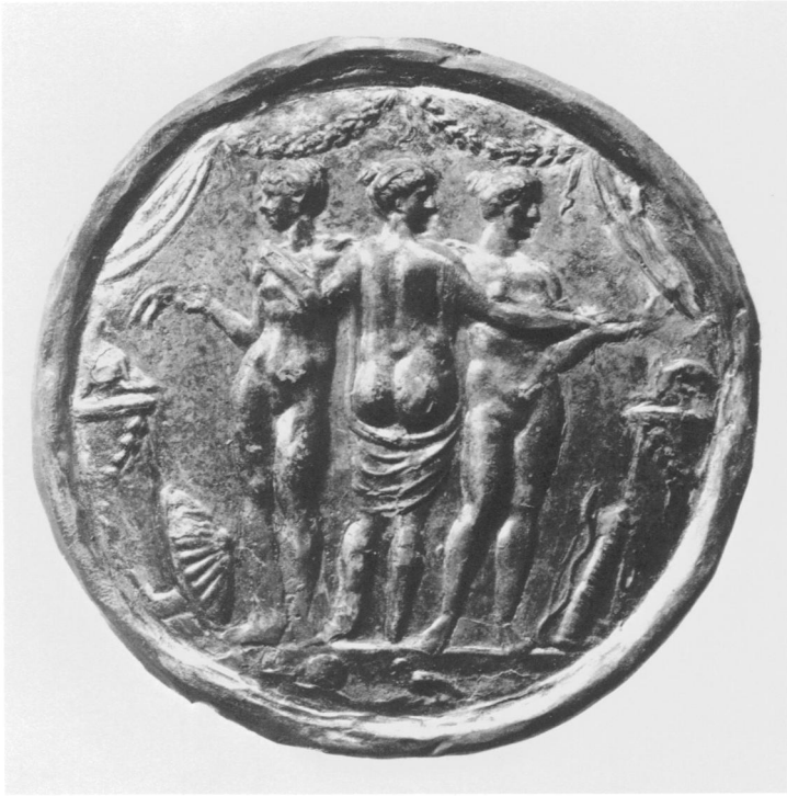
11. Roman mirror: The Three Graces (No. 10). Munich, Prähistorische Staatssammlung 1974, 3898a/b