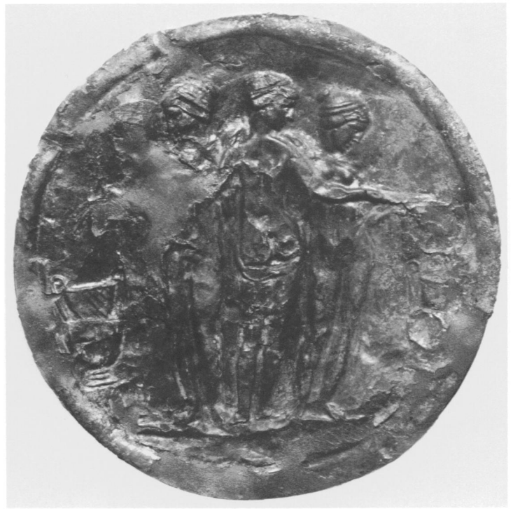
9. Roman mirror: The Three Graces (No. 8). Malibu, The J. Paul Getty Museum 76.AC.59