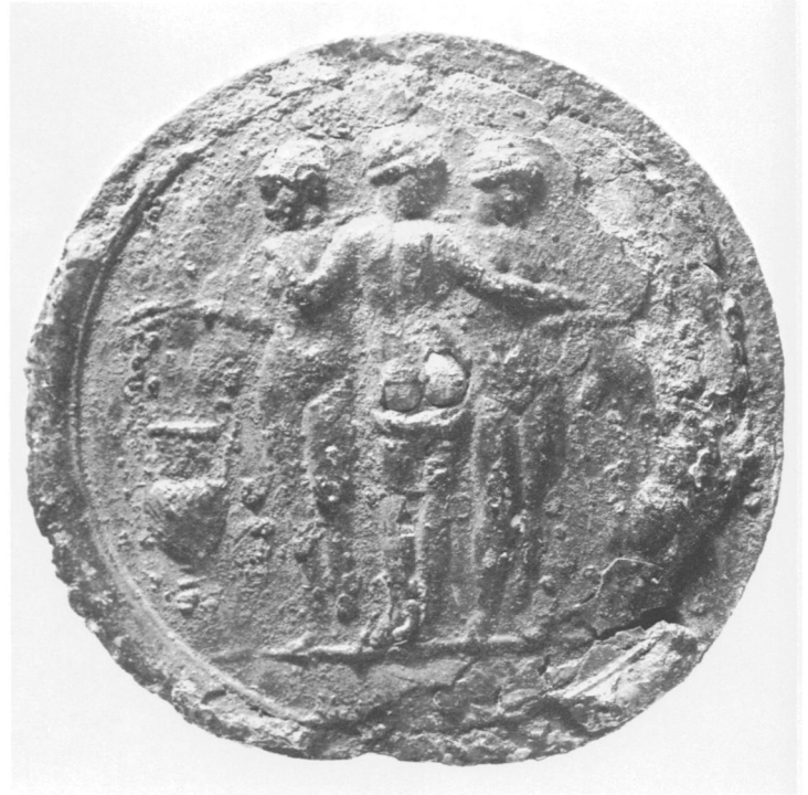
5. Roman mirror: The Three Graces (No. 4). Leningrad, The State Hermitage Museum 1894.39