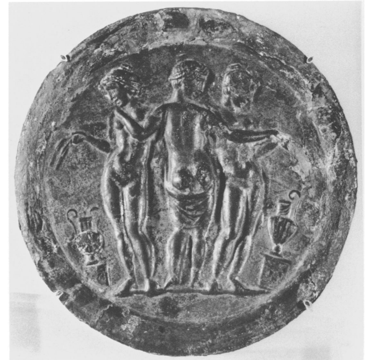
6. Roman mirror: The Three Graces (No. 5). Toronto, The University of Toronto Malcove Collection M82.257