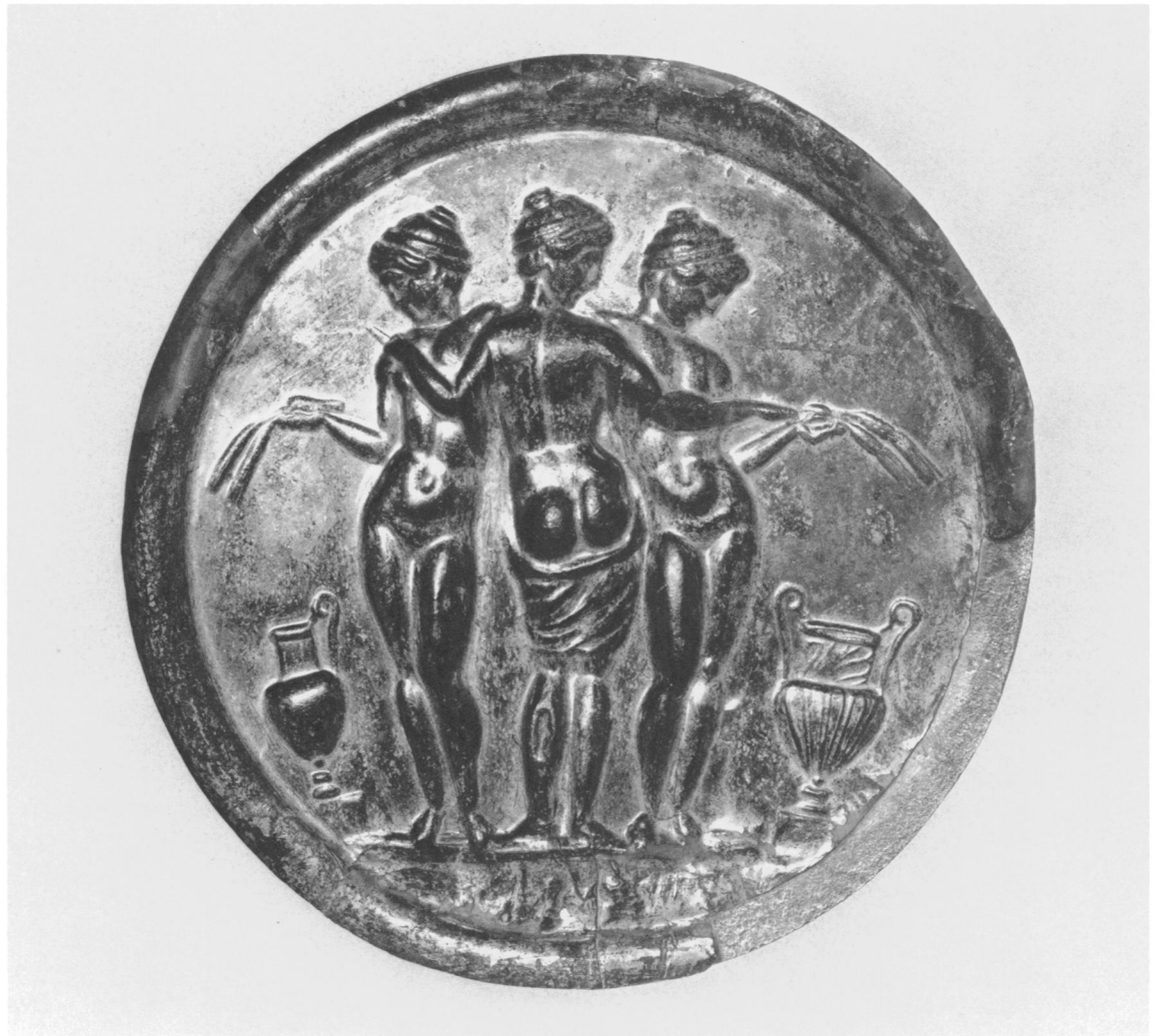
1. Roman mirror: The Three Graces (No. 1). The Metropolitan Museum of Art, Purchase, Sarah Campbell Blaffer Foundation Gift, 1987, 1987.11.1