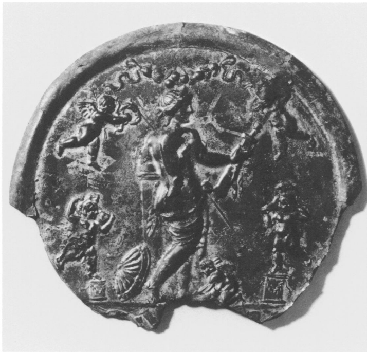
16. Roman mirror: Venus Victrix. Antikenmuseum Berlin, Staatliche Museen Preussischer Kulturbesitz, Misc. 7965

the scene to be represented existed in intaglio, or concave form. 45 After removal from the matrix, the sheet was set, front side up, into a cushioning bed of pitch, and the design was finished with chasing tools. When the relief was finished it was gilded, probably by the mercury amalgam process, and then burnished. 46 The repoussé disk was then ready to be attached, with supportive and adhesive material, to a mirror composed of a high tin bronze alloy, 47 which could have been manufactured elsewhere in the workshop or in a different workshop altogether.