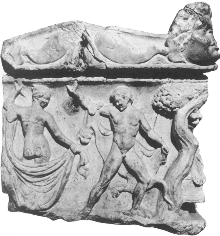
13. Left side of sarcophagus showing maenad and satyr. Verona, Museo Maffeiano 114