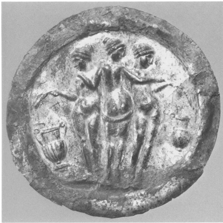
7. Roman mirror: The Three Graces (No. 6). Basel, H. A. C.