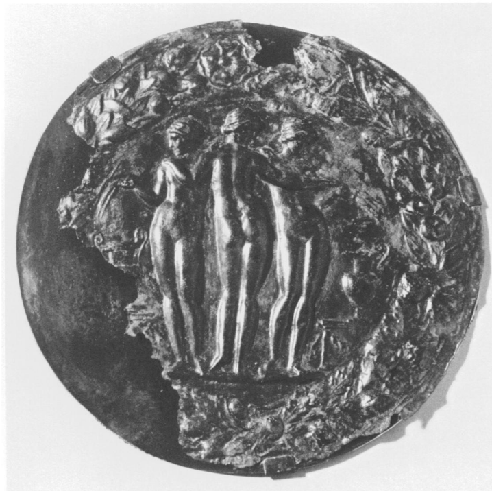
12. Roman mirror: The Three Graces (No. 11). Paris, art market

ently turned to the repertory of late Hellenistic and Neo-Attic motifs for a variation of the nude group. The maenad on the sarcophagus in Verona again offers a close parallel. The pose itself is similar to that of the central Grace; the drapery exposes the buttocks and is drawn upward and flipped over the left upper arm in exactly the way it is draped over both arms of the figure on the mirror. It is not impossible that the designer of the mirror had this very figure type in mind; enough examples remain in various media to know that it must have been a well-known motif in the sketchbooks and models that circulated in workshops around the Empire. 36