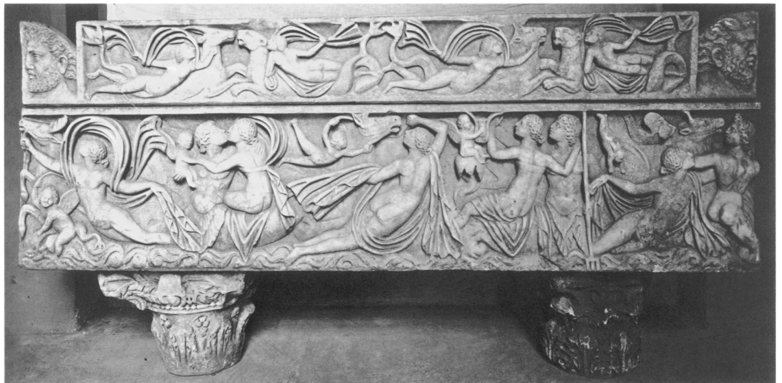
15. Sarcophagus showing Nereids and Tritons. Rome, Palazzo Conservatori, Museo Nuovo 2269