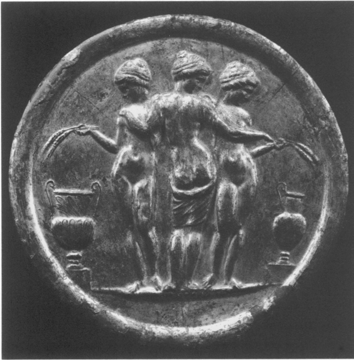
3. Roman mirror: The Three Graces (No. 2). Seattle, The Seattle Art Museum, Eugene Fuller Memorial Collection, 67.98