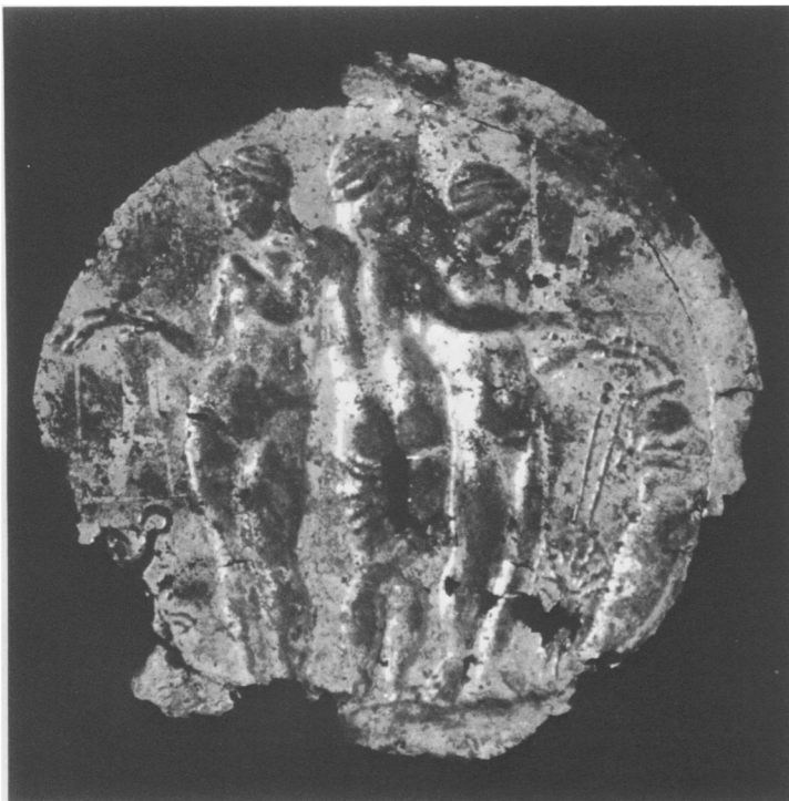
10. Roman mirror: The Three Graces (No. 9). Formerly, Tunis, Musée National du Bardo (Alaoui) (Drawing from G. Zahlhaas, Römische Reliefspiegel , pl. 3)