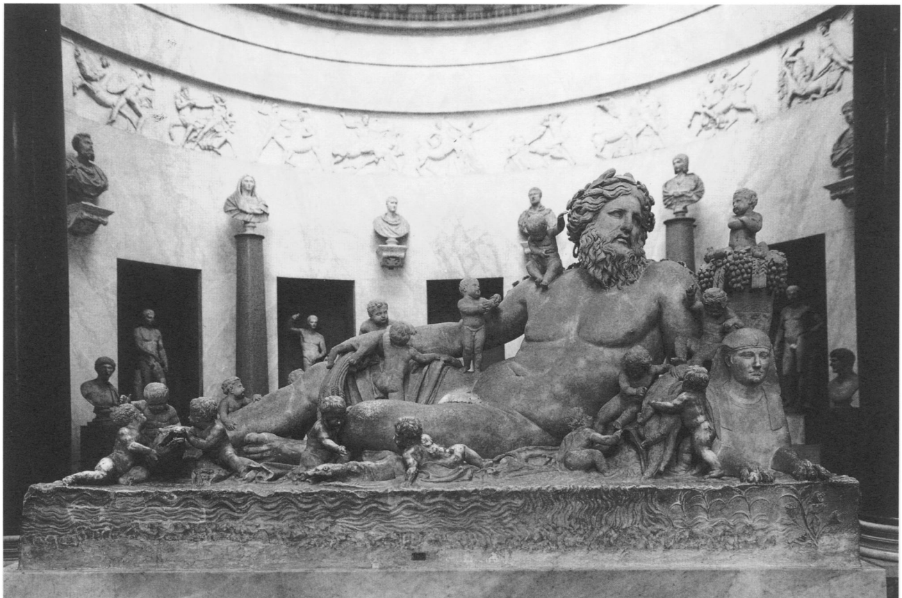
Figure 5. The River Nile , Roman copy of a Hellenistic statue, probably Alexandrian in origin. Marble, L. 10 ft. 2 in. (3.1 m). Musei Vaticani, Rome

The Egyptians, too, have discovered in Ethiopia the stone known as "basanites," which in color and hardness resembles iron, whence the name that has been