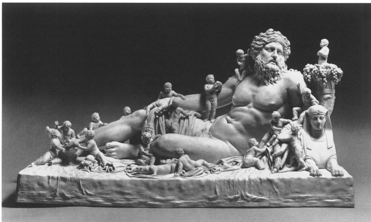
Figure 2. Giovanni Volpato, after the antique, The River Nile , ca. 1785–95. Hard-paste biscuit porcelain, H. 11 \frac{1}{4} in. (29 cm), W. 22 \frac{1}{4} in. (57 cm), D. 11 \frac{1}{4} in. (28.9 cm). The Metropolitan Museum of Art, Purchase, The Isak and Rose Weinman Foundation Inc. Gift, 2001 (2001.456)