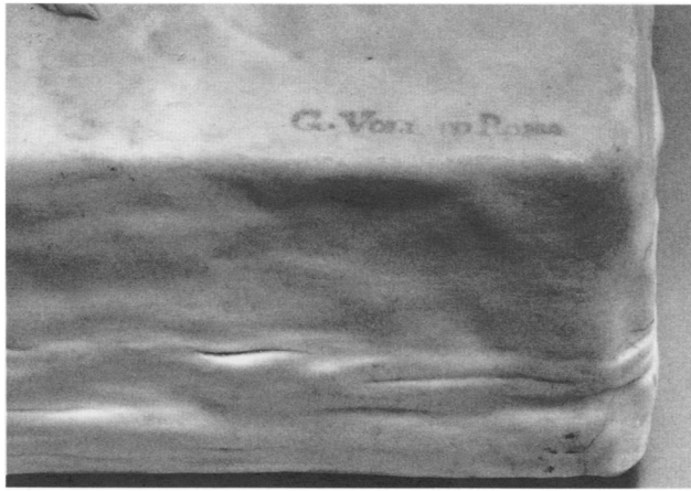
Figure 4. Stamped signature on Figure 2: G. VOLPATO ROMA

of the shrine to Isis and Serapis, near Santa Maria sopra Minerva, and its placement in the Vatican Belvedere, the Nile was viewed as one of the most curious relics of the ancient world. In Volpato's day, it was in the Sala degli Animali, which he often traversed on his way to make drawings for engravings after Raphael;