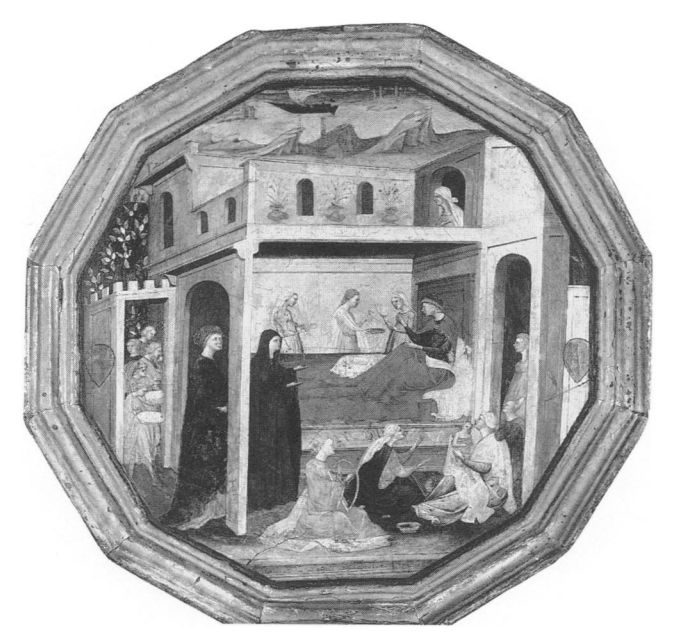
Figure 6. Bartolommeo di Fruosino (1366/69-1441). Confinement Room Scene (front of a childbirth tray), 1428. Tempera, gilt, and silver on panel. Private collection (on loan to The Metropolitan Museum of Art)

According to both surviving examples and documentary evidence, the early trays were painted with