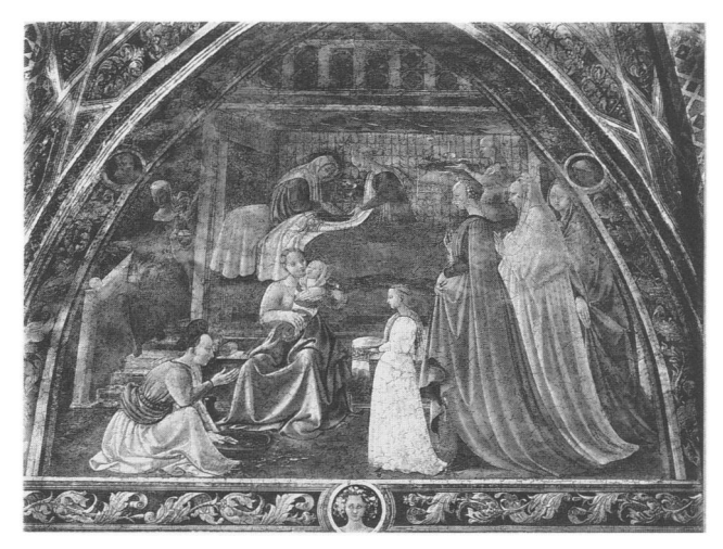
Figure 5. Paolo Uccello (1397–1475). The Birth of the Virgin , ca. 1436. Fresco. Prato, Cathedral

We can learn much about the production of birth trays by a close physical examination. Most surviving examples measure between fifty and sixty centimeters in diameter. <sup>29</sup> Although contemporary inventories do not provide exact measurements, a standard is implied when the clerk described a tray as large or small. <sup>30</sup> Their size probably made it easy to construct them