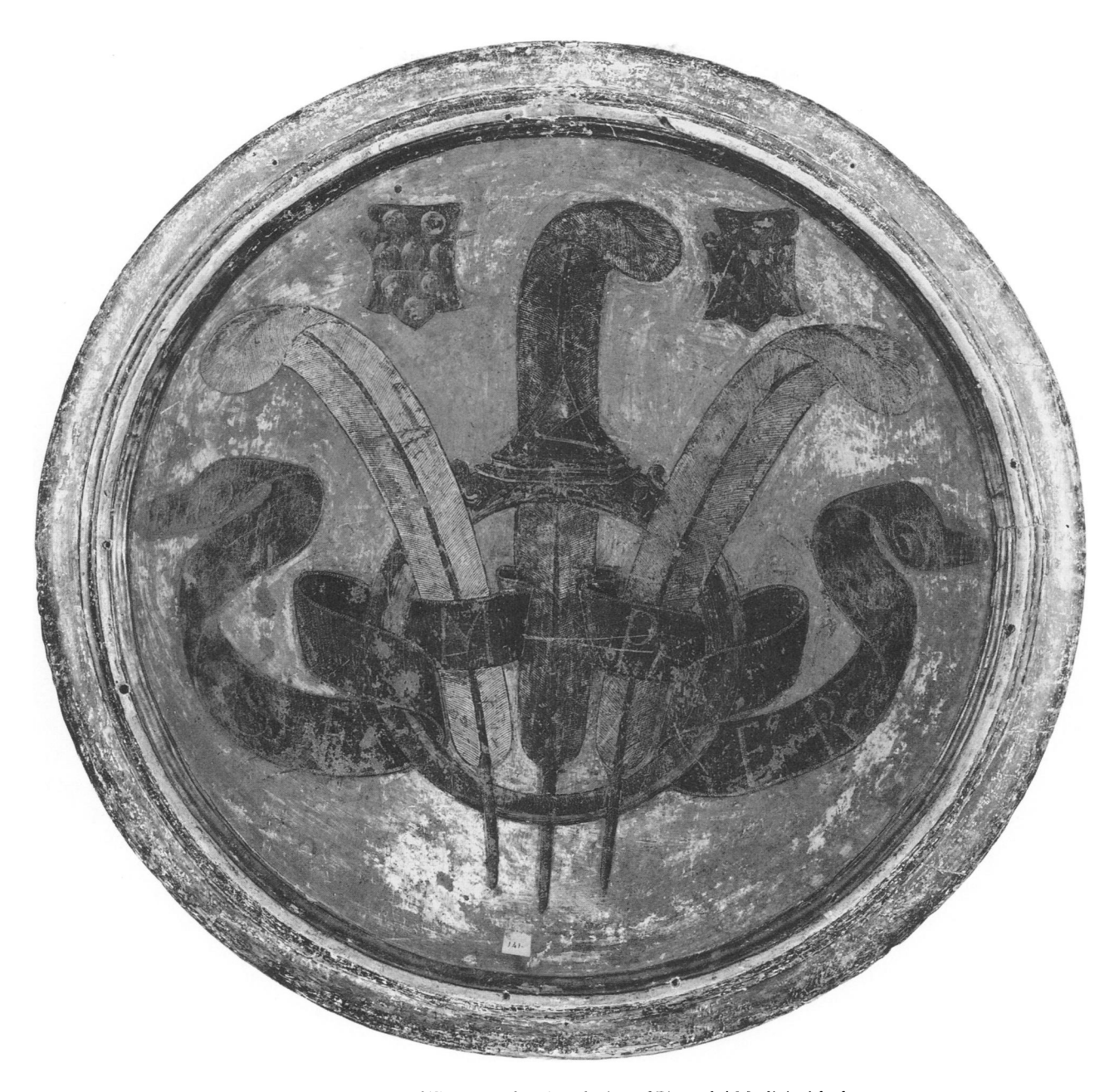
Figure 2. Verso of Figure 1, showing device of Piero de' Medici with the Medici and Tornabuoni coats of arms

tenets of linear perspective. In the center is a fantastically articulated pedestal, which combines disparate elements of classical architecture to render a complex pastiche structure. On top of the pedestal is a fluted globe, no doubt meant to signify the orb of the world. This globe may take the place of the mandorla within which the figure of Fame often stood in more traditional representations of the subject. The use of the mandorla followed Boccaccio's description in Amorosa visione , which read,