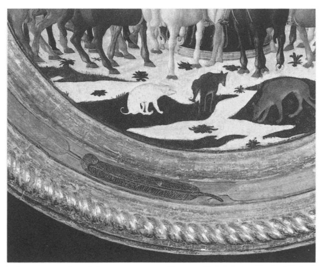
Figure 4. Detail of Figure 1, showing frame

But the circular shape of the Medici-Tornabuoni tray itself may have worked here as Boccaccio's "perfect circle," encompassing everything painted on this tray—both nature and humankind—within the orbit of Fame.