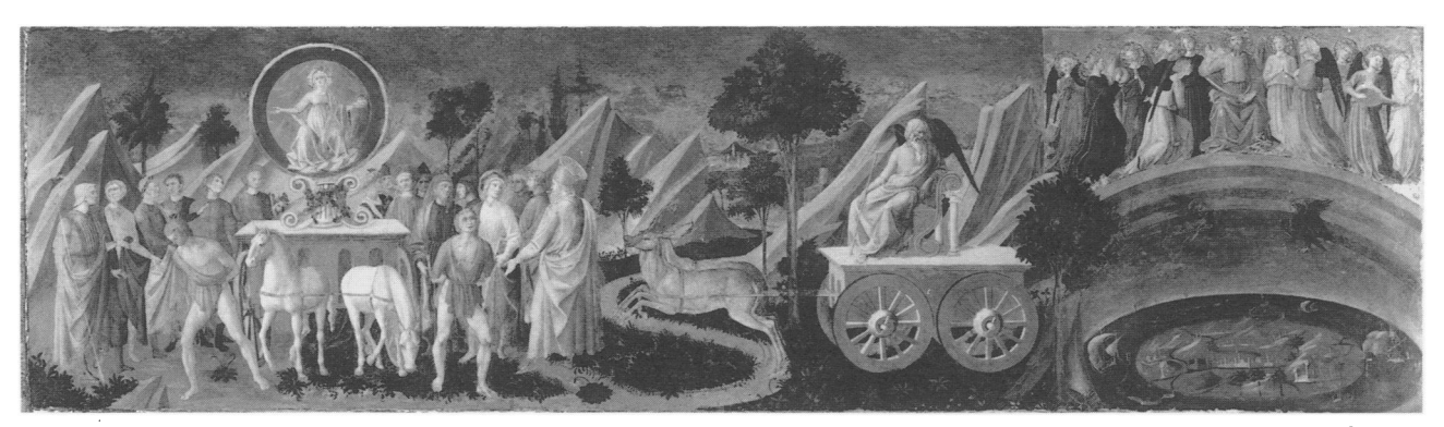
Figure 11. Francesco Pesellino (1422–1457). The Triumphs of Fame, Time, and Eternity (panel from a marriage chest), ca. 1448. Tempera on chestnut wood. Boston, Isabella Stewart Gardner Museum

Whether for sentimental, aesthetic, or even political reasons, it is clear that Lorenzo continued to value the birth tray given to his mother on the occasion of his birth. It was hanging in his room when he died in 1492, at the age of forty-three. Childbirth trays were usually listed in inventories alongside paintings or works of art that hung on the wall or rested in small niches; one gets the impression that the clerk simply listed all the works of art in the order he saw them as he looked around the room. And, in fact, Lorenzo's tray is listed between two paintings, apparently topographical views of the Holy Land and of Spain (both valued at several florins less than the tray), which implies that it hung on a wall between the two, with its heraldic side hidden from view. This would explain