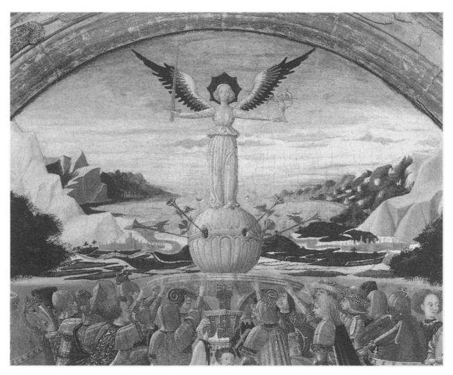
Figure 3. Detail of Figure 1, showing Fame