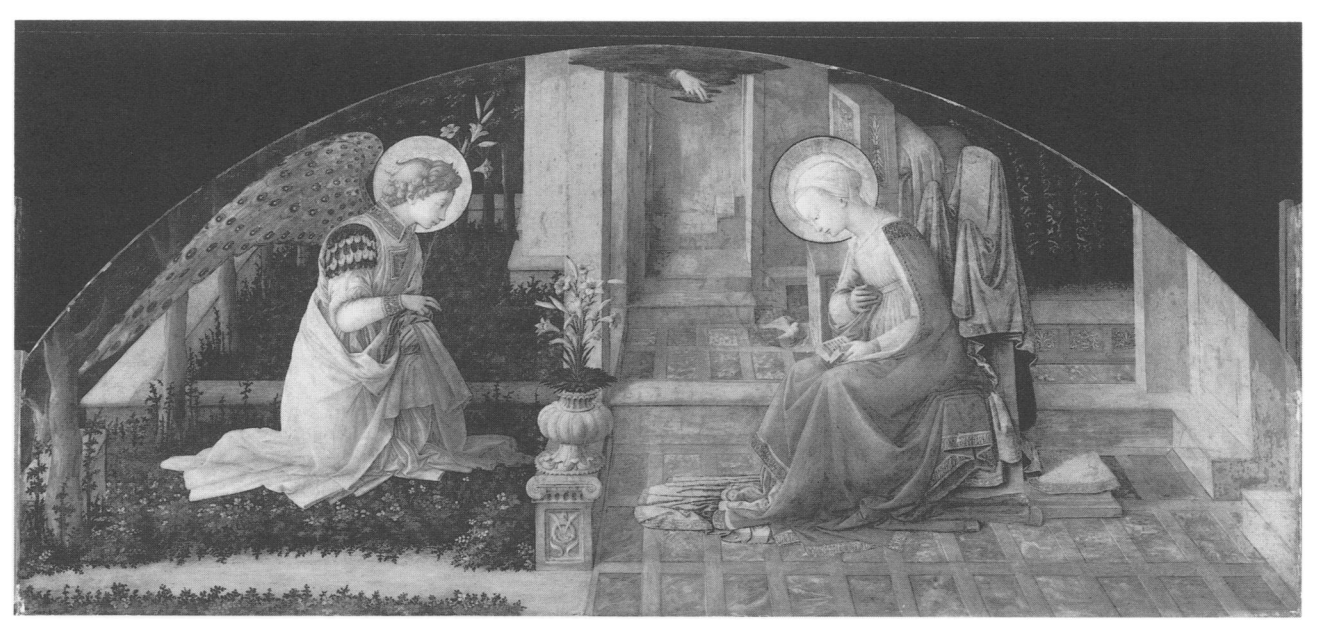
Figure 9. Fra Filippo Lippi (ca. 1406–1469). The Annunciation, ca. 1448. Tempera on panel. London, National Gallery

venture for a mere stock item. And the large-scale device and coats of arms make a deliberate reference to Medicean pride and lineage.