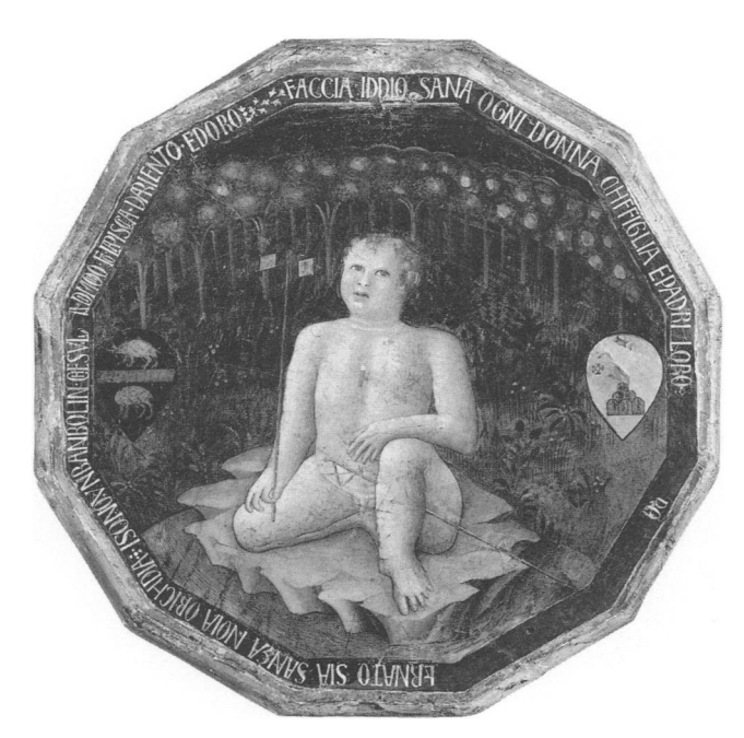
Figure 7. Verso of Figure 6

tempera on both sides and usually had gilt frames or moldings.<sup>33</sup> The frames were attached to one or both sides of the tray. Evidence of paint overlap on intact frames and the painted outlines visible on trays that have had their frames removed indicate that the trays were painted with their frames already attached. Although this procedure made the panels unwieldy, it was practical, since the painted surface would be damaged if the