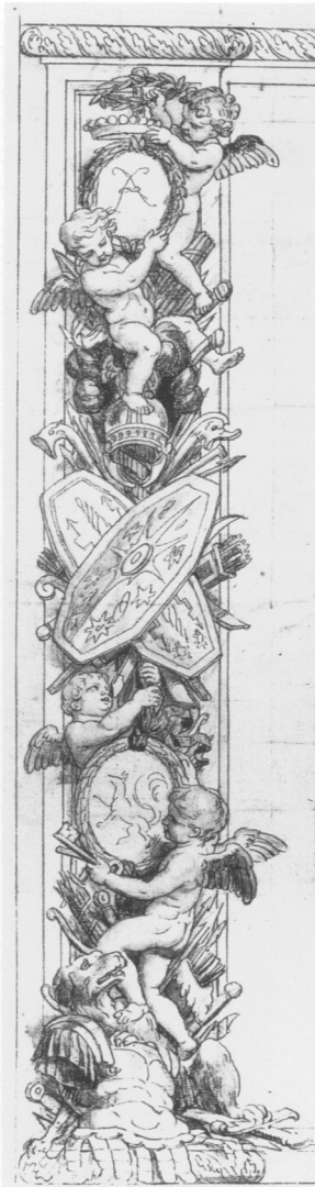
Figure 6. Charles Le Brun. Drawing for a tapestry border with the arms of Nicolas Fouquet. Red chalk, ink, and watercolor, 17 x 5½ in. (43.3 x 12.9 cm). Stockholm, Nationalmuseum, NM CC I:34

A minimum of alterations was needed to make the second drawing (Figure 7) suitable for use at the Gobelins. A rayed sun is substituted for the crossed F's, flanked by a pair of scales and sur-