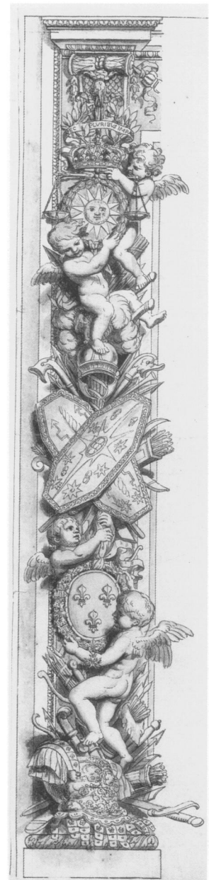
Figure 7. After Charles Le Brun. Drawing (tracing) with emblems of Louis XIV. Ink and watercolor, 20¾ x 4¾ in. (52.3 x 11.6 cm). Stockholm, Nationalmuseum, NM CC I:33

mounted by a royal crown and the king's motto, Nec Pluribus Impar , as in the portière , the Char de Triomphe (see Figure 2). Fleurs-de-lis replace the