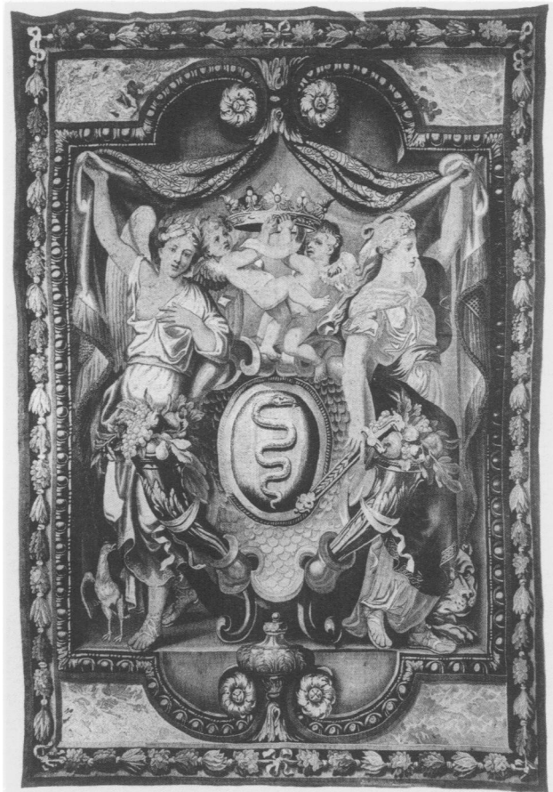
Figure 5. Wool and silk tapestry with the arms of Jean-Baptiste Colbert, French (Gobelins), ca. 1662–83, after Charles Le Brun. 9 x 7 ft. (274.5 x 213.5 cm). Les Affaires Culturelles: Île de France, on loan to the Château of Vaux-le-Vicomte

These words and the climbing squirrel that replaces the royal arms show that the drawing was made for Nicolas Fouquet (1615–1680), Louis XIV's powerful minister, whose bold motto was Quo non ascendet? and whose arms were a rampant squirrel. 11 The women who raise the festoons are very different from their counterparts in the tapestry and, as one would expect in a Le Brun composition, are clearly identifiable by their emblems. The one who corresponds to Fame, on the left in the drawing, has no wings, holds a key, and has a dog at her feet; she is Fidelity or Loyalty. 12 The woman on the right side of the Hermitage drawing wears the lion skin of Hercules but no armor; she has the same small mask between her breasts that is worn by the so-called Flora in the tapestry. The lion below her shows she must represent Power, Valor, Strength,