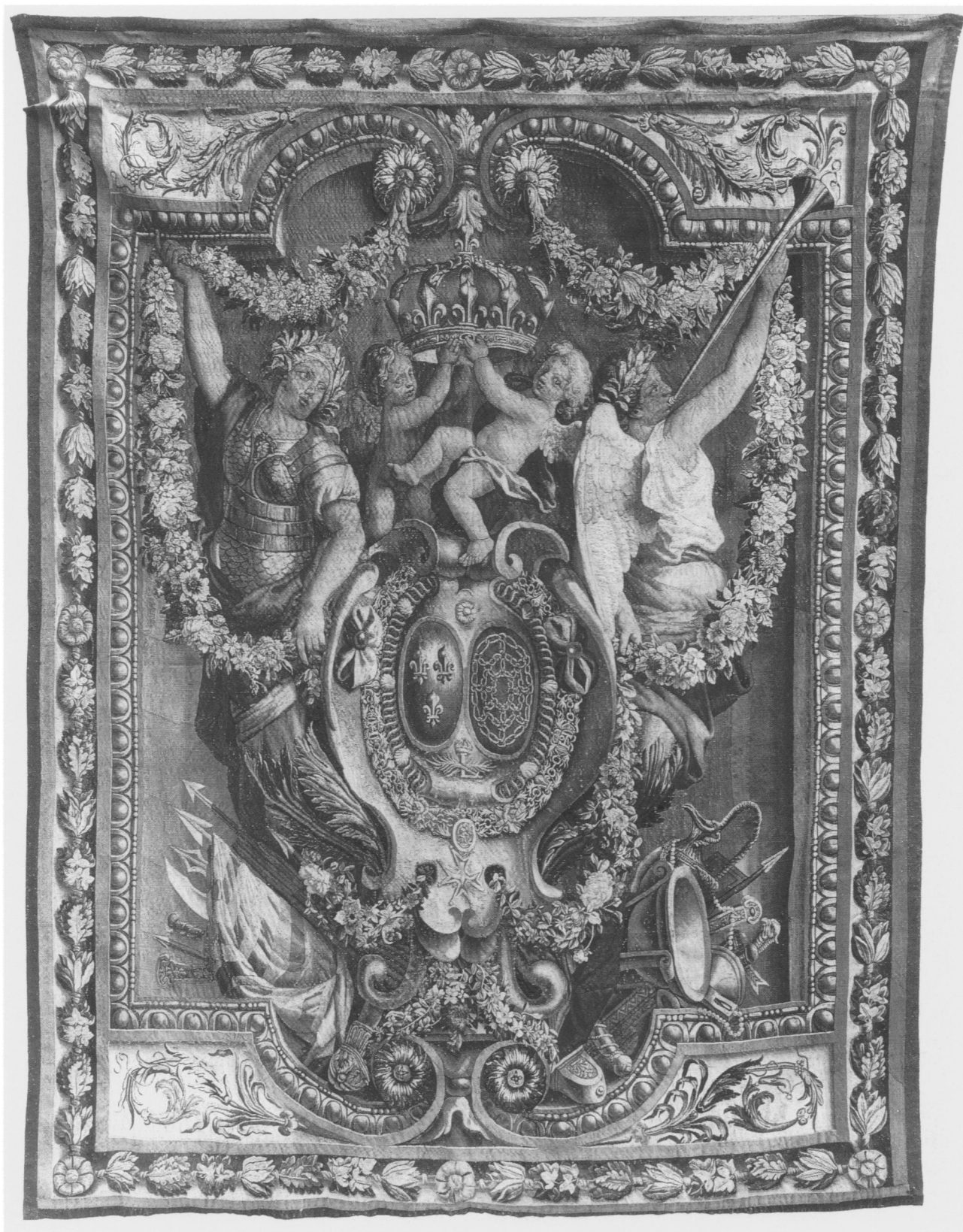
Figure 1. Les Renommées , French (Gobelins), 1693–1700, after Charles Le Brun (1619–1690). Wool and silk tapestry, 9 ft. 4 in. x 7 ft. 1 in. (284.7 x 216 cm). The Metropolitan Museum of Art, Gift of Mrs. Lionel F. Straus, in memory of her husband, Lionel F. Straus, 1953, 53.57. See also Colorplate 2