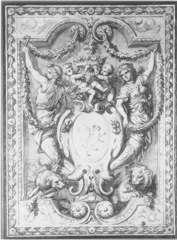
Figure 3. Charles Le Brun. Drawing for a portière with the arms of Nicolas Fouquet, 1659–61. Black and red chalk and ink, washed with gray, 17 x 8½ in. (43.2 x 21 cm). Saint Petersburg, The State Hermitage, 18959

Fame, as she has wings and blows a trumpet. 7 She holds it with her right hand, which also supports a long festoon of brightly colored leaves and flowers, including roses, tulips, and poppies. Fame rises from an acanthus-leaf cornucopia and her left arm passes behind her back so she can grasp the festoon as it falls down the side of the central cartouche. Her head is wreathed with laurel. The woman on the left is in classical armor with a small mask between her breasts; she wears a wreath on her head and with both hands holds a festoon like that of her companion. Two lively, winged, nearly nude children raise the crown between the women. On either side of the coats of arms and the collars of the orders are large bows. At the base of the design, behind the lower part of the central scrolling forms and the festoons, are two trophies of antique arms and spoils—spears, sword hilts, a striped flag, a ewer, a bowl (or drum), a string of pearls, and some drapery.