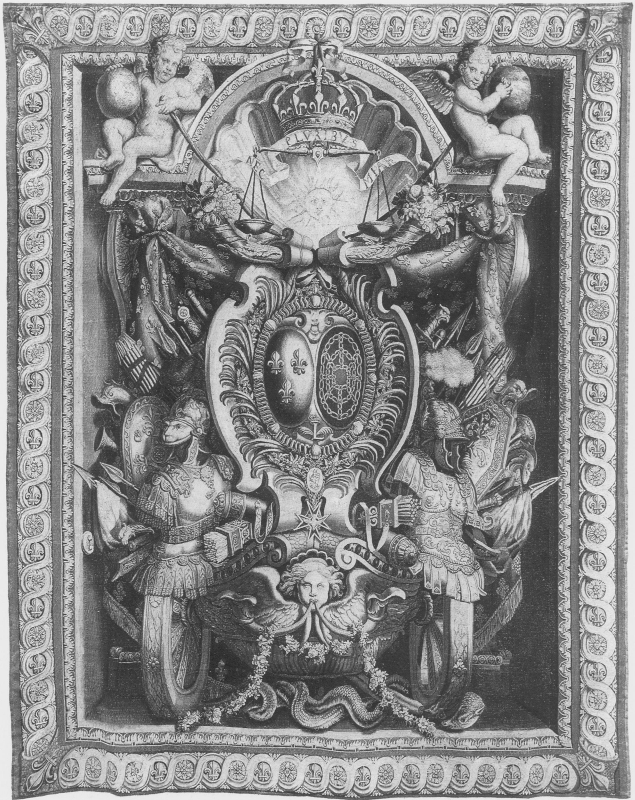
Figure 2. Le Char de Triomphe , French (Gobelins), 1662–1724, after Charles Le Brun. Wool and silk tapestry, 11 ft. 2 in. x 8 ft. 10 in. (340.6 x 269.4 cm). The Metropolitan Museum of Art, Gift of Thomas Emery, 1954, 54.159. See also Colorplate 3