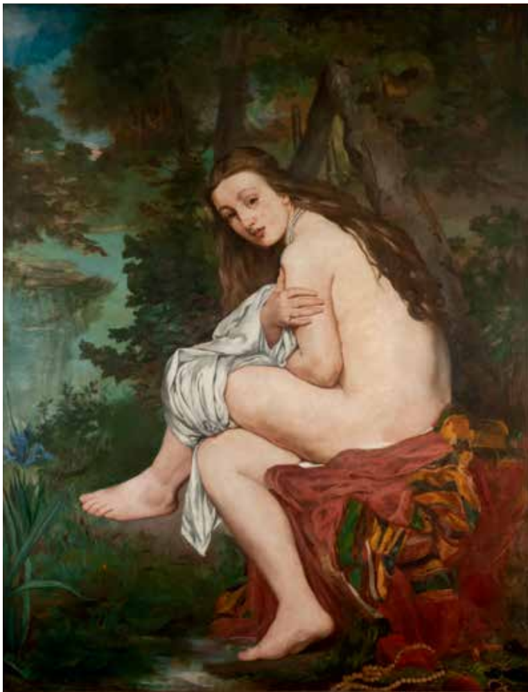
fig. 2 Edouard Manet (French, 1832–1883). La Nymphe surprise ( The Surprised Nymph ), by 1861. Oil on canvas, 56 \frac{7}{8} × 44 \frac{1}{4} in. (144.5 × 112.5 cm). Museo Nacional de Bellas Artes, Buenos Aires

Manet's Mademoiselle V. en costume d'espada ( Mademoiselle V. . . in the Costume of an Espada ; fig. 3) is signed and dated 1862; an etching of the same composition was published in October of that year. 12 An X-radiograph of the painting reveals an upside-down seated nude painted under the female