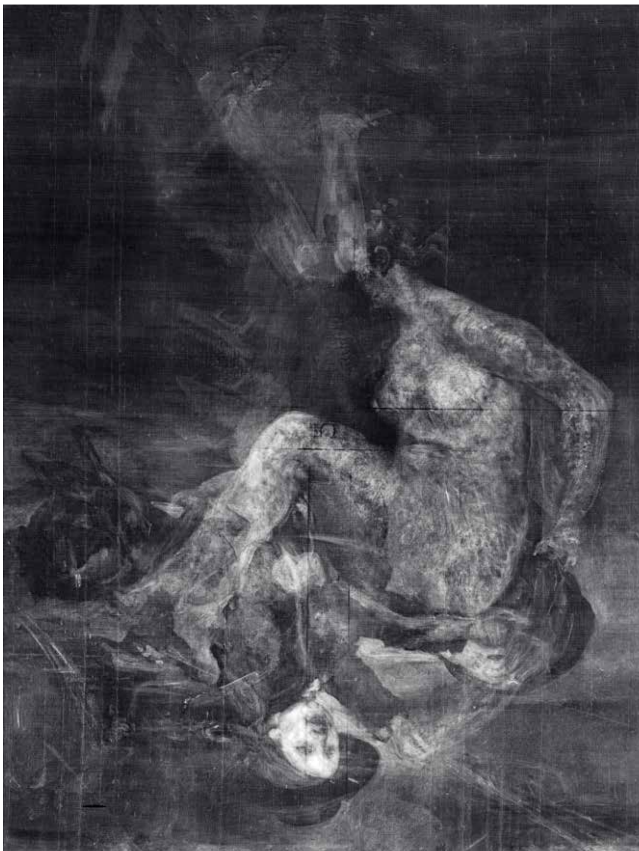
fig. 4 X-radiograph of Mademoiselle V... in the Costume of an Espada (fig. 3). The canvas appears upside down in the X-radiograph.