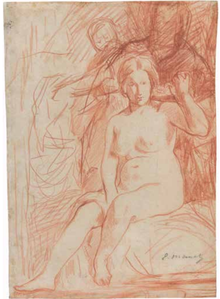
fig. 12 Edouard Manet, Study of a Seated Female Nude (known as La Toilette ), ca. 1860. Red chalk, 11 \times 7 \frac{1}{2} in. (28 \times 20 cm). Art Institute of Chicago, Restricted Gift of the Joseph and Helen Regenstein Foundation (1967.30)

and Paul Cézanne owned a photograph of it. 38 James McNeill Whistler copied it for an American collector (fig. 13), 39 and Auguste Renoir adapted it for a decorative motif on a dessert service. 40 As Renoir's monumental Diane of 1867 (fig. 14) and Grandes baigneuses of 1884–87 (fig. 15) attest, Boucher's picture would exercise a particular fascination over him throughout his career. 41 Indeed, near the end of his life, Renoir confided to the dealer Ambroise Vollard: