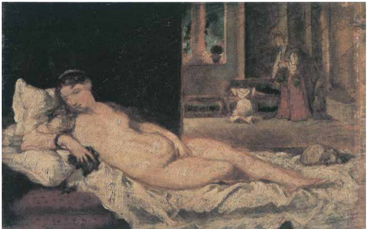
fig. 10 Edouard Manet, after Titian. Venus of Urbino , probably 1857. Oil on panel, 9½ × 14⅞ in. (24 × 37 cm). Private collection

way station on the road to the two most challenging nudes of the nineteenth century: the Déjeuner and the Olympia . 28