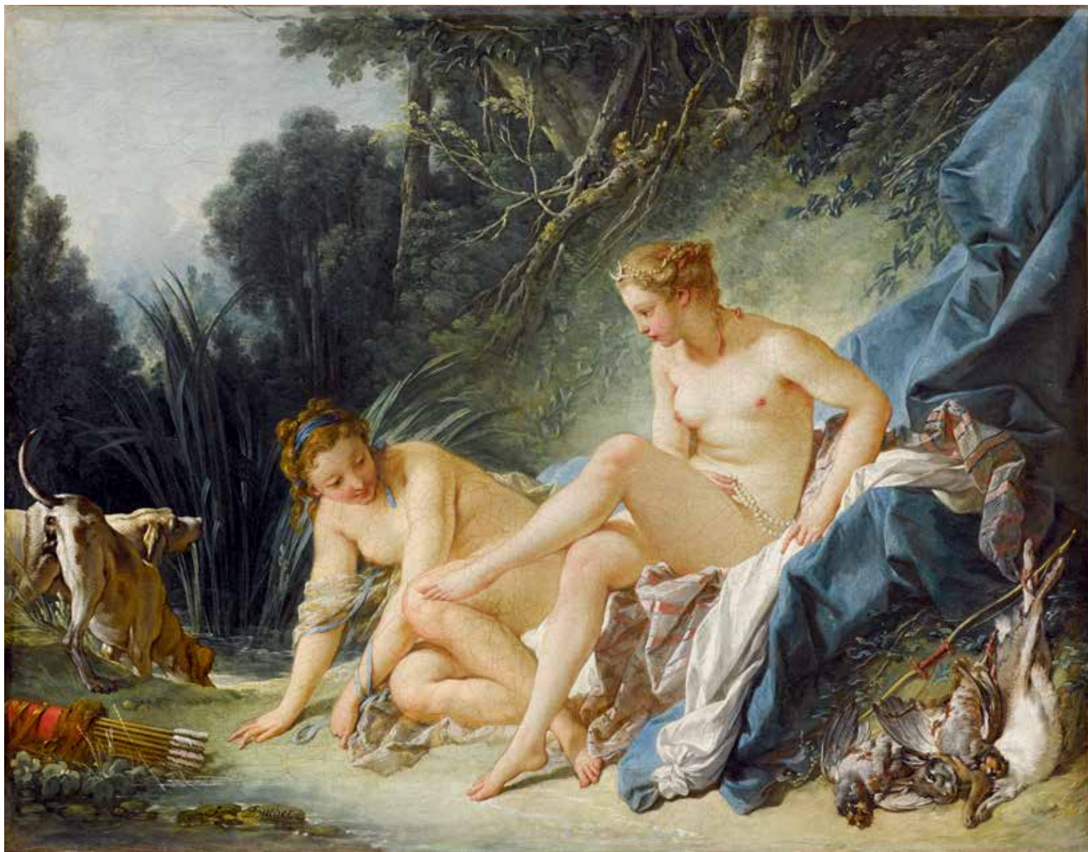
fig. 1 François Boucher (French, 1703–1770). Diane sortant du bain ( Diana Leaving Her Bath ), 1742. Oil on canvas, 22 × 28¾ in. (56 × 73 cm). Musée du Louvre, Département des Peintures, Paris (2712)