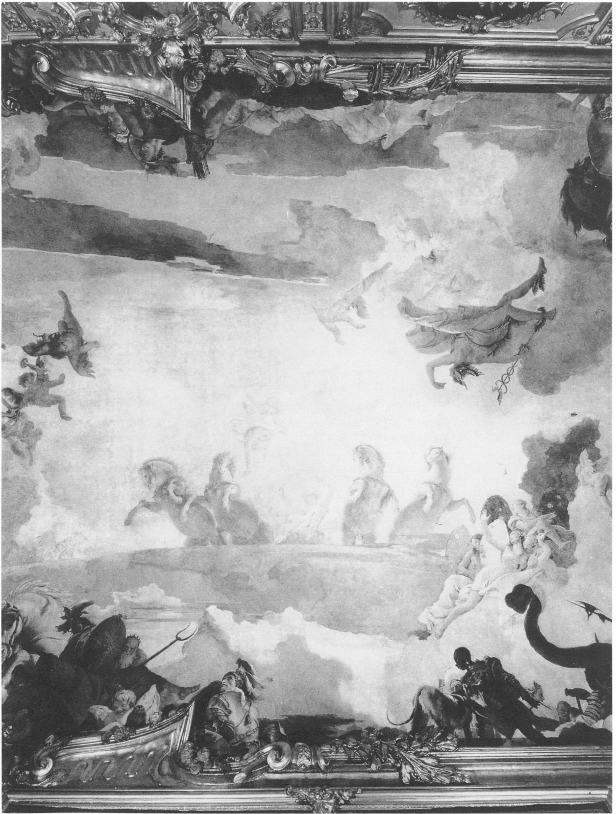
Figure 8. Giambattista Tiepolo. The Course of the Sun , detail showing the chariot of Apollo. Fresco. Milan, Palazzo Clerici