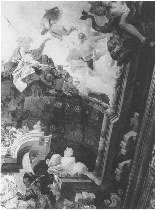
Figure 7. Giambattista Tiepolo. The Course of the Sun , detail showing Maenads and Satyrs. Fresco. Milan, Palazzo Clerici

about the great Tintoretto of the Scuola di San Rocco in 1846, they were sadly neglected and doomed to destruction because of the rain that seeped in through the roof and onto the canvases themselves.