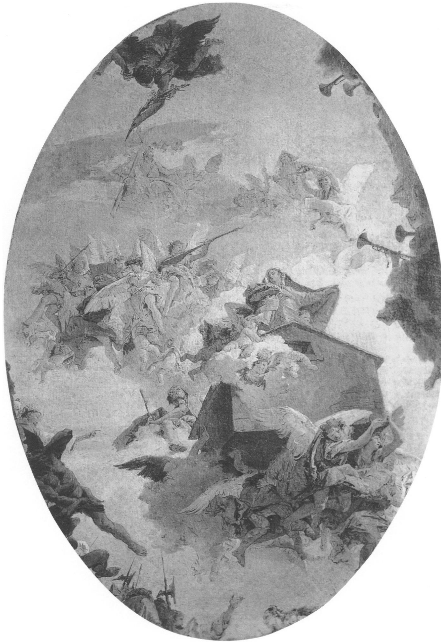
Figure 3. Giambattista Tiepolo. The Miracle of the Holy House of Loreto . Oil sketch, 124 x 85 cm. Venice, Gallerie dell'Accademia

In a preface, published in 1908, James recalled being in Venice and writing A London Life :