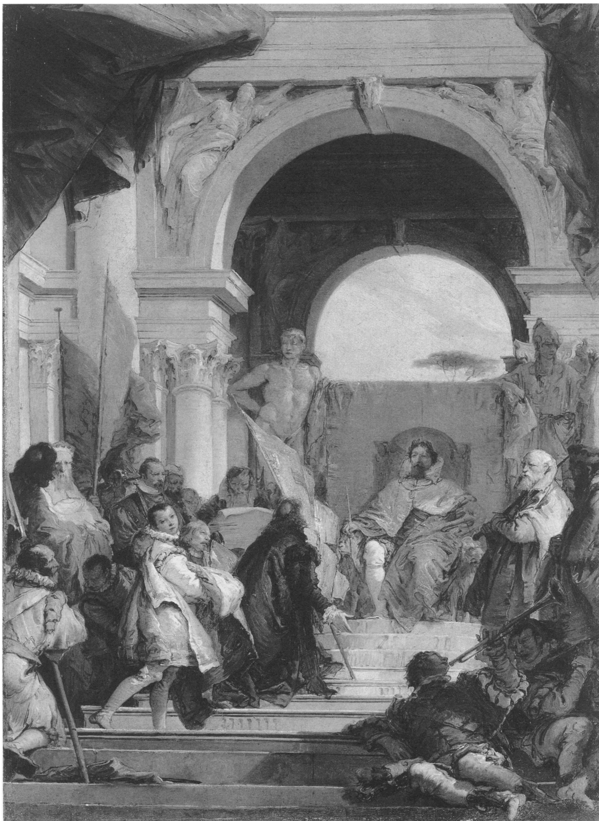
Figure 1. Giambattista Tiepolo (1696–1770). The Investiture of Bishop Harold as Duke of Franconia . Oil sketch, 71.8 x 51.4 cm. The Metropolitan Museum of Art, Purchase, 1871, 71.121