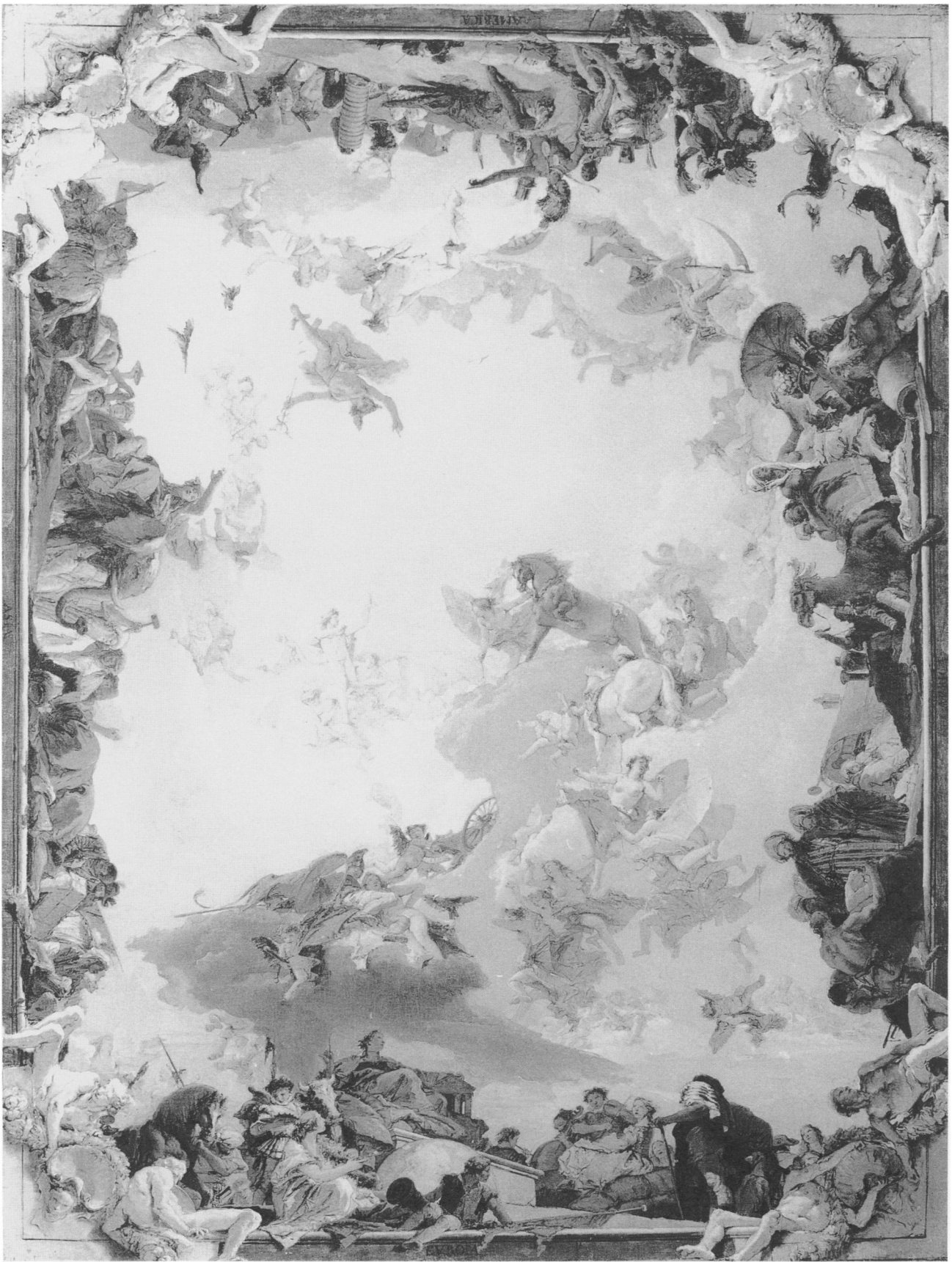
Figure 13. Giambattista Tiepolo. Apollo and the Four Continents (modello for fresco, Residenz, Würzburg). Oil on canvas, 185.4 x 139.4 cm. The Metropolitan Museum of Art, Gift of Mr. and Mrs. Charles Wrightsman, 1977, 1977.1.3