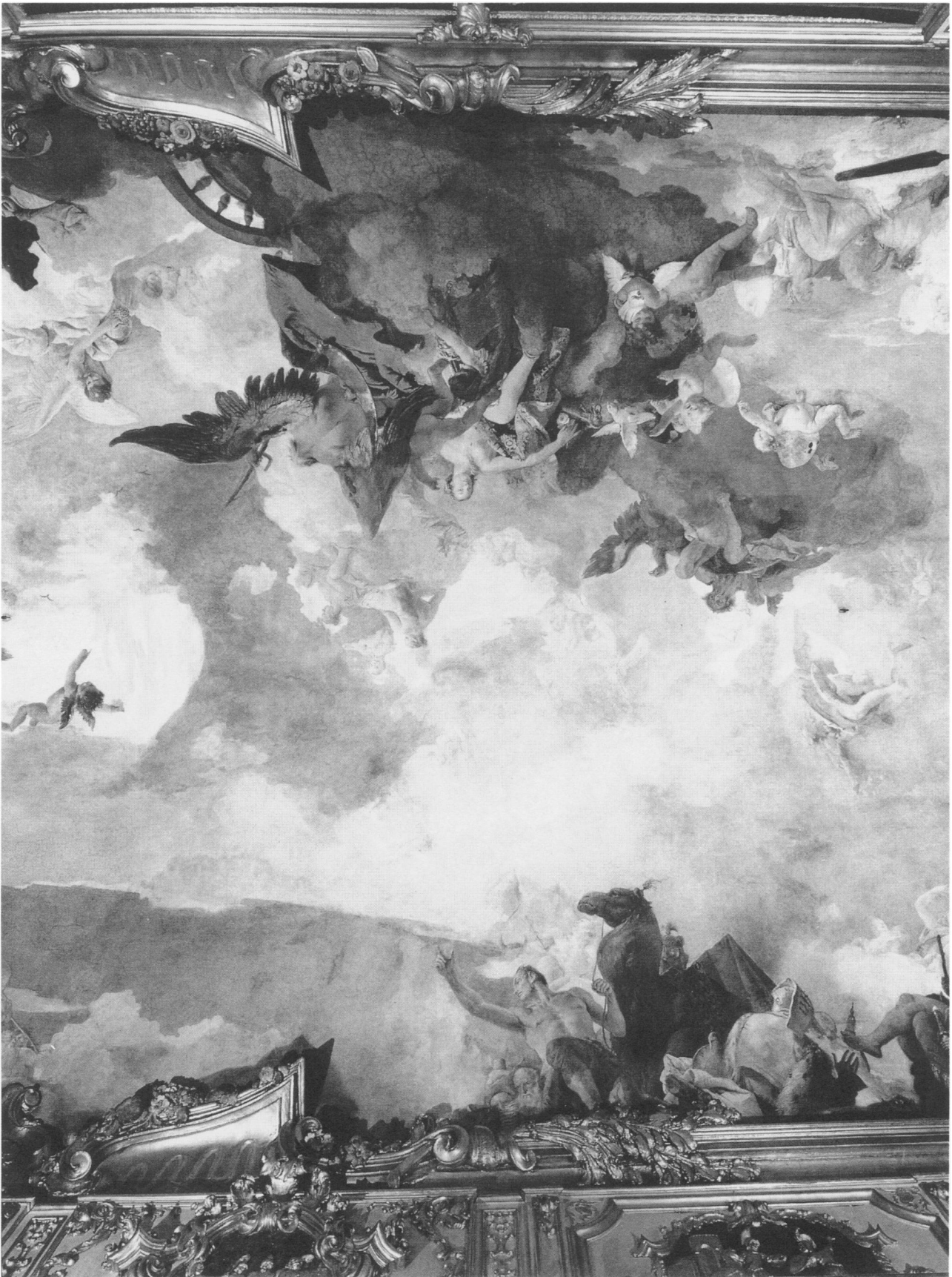
Figure 10. Giambattista Tiepolo. The Course of the Sun , detail showing the dromedary. Fresco. Milan, Palazzo Clerici