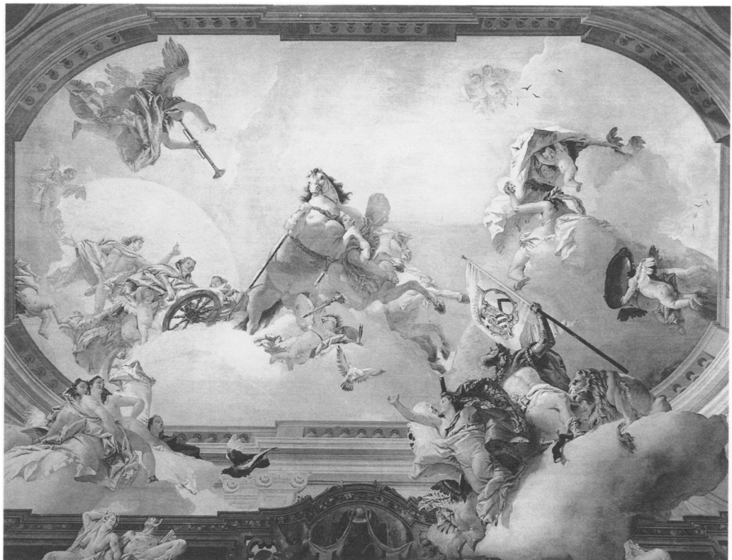
Figure 12. Giambattista Tiepolo. Wedding Allegory . Fresco. Venice, Museo del Settecento Veneziano, Ca' Rezzonico

When the curtain fell the Procuratoressa led the company to the circular saloon which, as in most villas of the Venetian mainland, formed the central point of the house. . . . His [Odo's] eye . . . was soon drawn . . . to the ceiling which overarched the dancers with what seemed like an Olympian revel reflected in the sunset clouds. Over the gilt balustrade surmounting the cornice lolled the figures of fauns, bacchantes, nereids and tritons, hovered over by a cloud of amorini blown like rose-leaves across a rosy sky, while in the center of the dome Apollo burst in his chariot through the mists of dawn, escorted by a fantastic procession of the human races. These alien subjects of the sun—a fur-clad Laplander, a turbaned figure on a dromedary, a blackamoor and a plumed American Indian—were in turn surrounded by a rout of Maenads and Silenuses, whose flushed advance was checked by the breaking of cool green waves, through