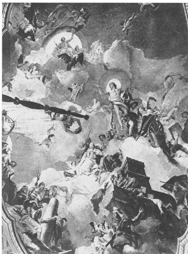
Figure 2. Giambattista Tiepolo. The Apotheosis of the Spanish Monarchy . Fresco. Madrid, Palacio Real

One blatant, pre-Ruskin example of "blindness" to Tiepolo is Washington Irving, who spent several months in Madrid and described at length his 1842 visit to the queen of Spain. Irving lingered and waited for the queen in the royal palace, and though he mentioned waiting in the royal halls, he did not seem to notice the great Tiepolo ceilings in the palace: the Apotheosis of the Spanish Monarchy (Figure 2) in the