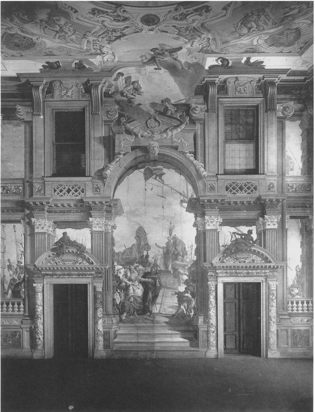
Figure 6. Giambattista Tiepolo. The Meeting of Antony and Cleopatra . Fresco. Venice, Palazzo Labia