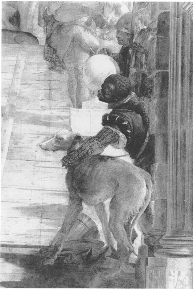
Figure 11. Giambattista Tiepolo. Detail of The Meeting of Cleopatra and Antony in Figure 6

Tiepolo. Although Wharton had prepared herself carefully by reading a number of works, including Vernon Lee's Studies of the Eighteenth-Century in Italy and books she had borrowed from Charles Eliot Norton, such as significant eighteenth-century memoirs by Goldoni, Lorenzo da Ponte, and Casanova, 70 her rendering of period Venice is fairly stereotyped. 71 This was not applicable to Wharton's description of an imaginary Tiepolo fresco in the villa where her protagonists meet. The prose suddenly seems to soar, like a flying angel in a Tiepolo ceiling: