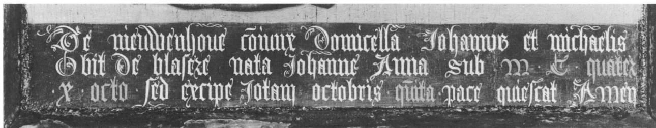
Figure 2. Detail of Figure 1 showing inscription

If this is so, the installation much resembled that of the lost epitaph of Wouter Metteneye in the same church. The sepulcher of the Metteneye family was situated at the southeastern side of the ambulatory. 27 Above this funerary monument a stone with an epitaph inscription and the family's coat of arms was set into the wall. On either side of it hung a painting: the one on the left represented Wouter Metteneye, the one on the right his wife, Margriete