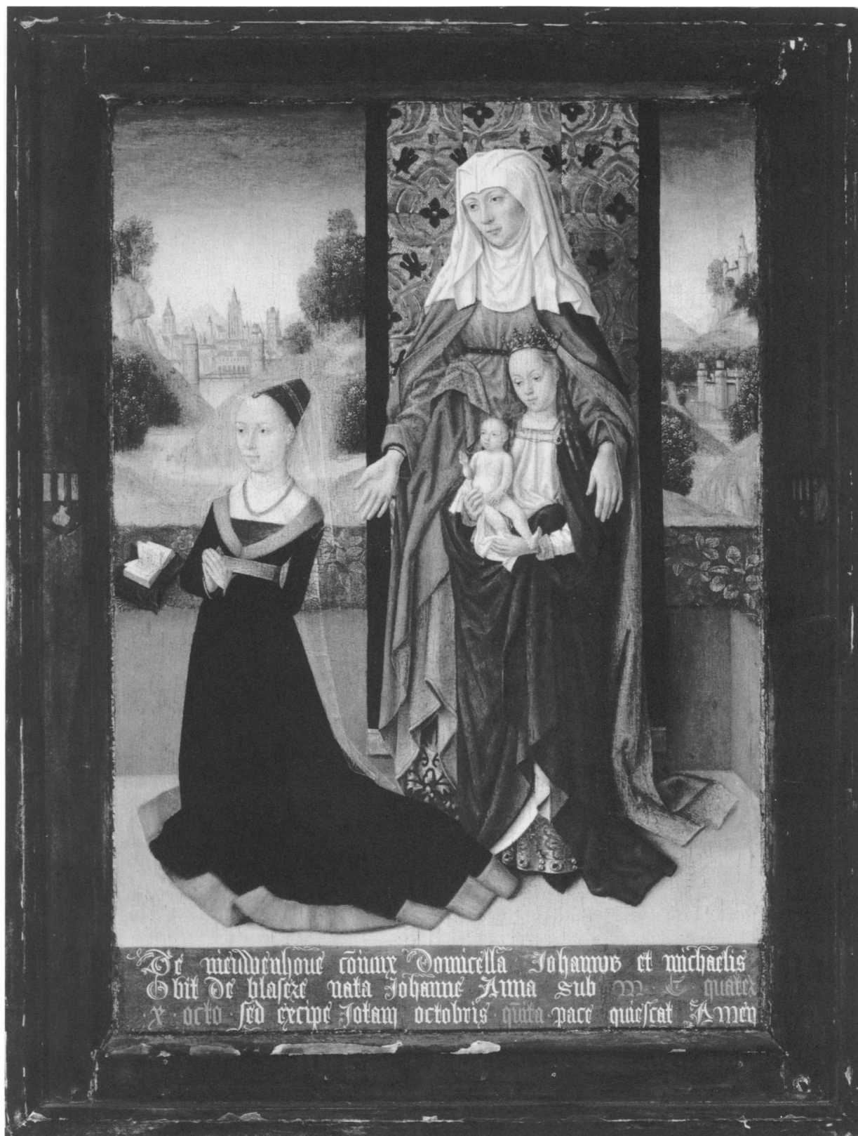
Figure 1. Master of the St. Ursula Legend, Virgin and Child, with St. Anne Presenting a Woman . Tempera and oil on wood, 49.9 × 34.3 cm. The Metropolitan Museum of Art, Robert Lehman Collection, 1975, 1975.1.114