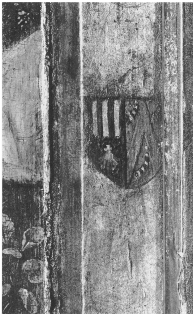
Figure 4. Detail of Figure 1 showing coat of arms on frame at right

to the Master of the St. Ursula Legend. Indeed, since the painting can be dated with relative precision between 1479 and 1483, it is a firm reference in the chronology of this Bruges master's oeuvre.