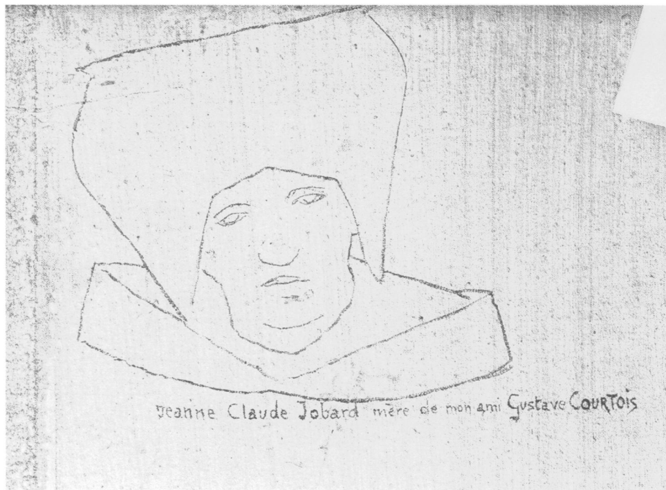
Figure 4. Inscription and drawing on lower right quadrant of verso of Figure 1