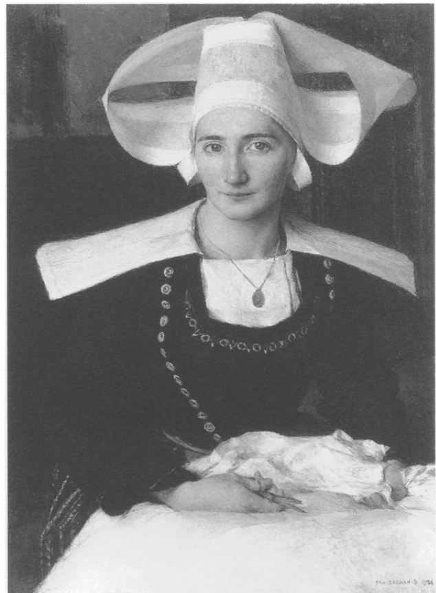
Figure 5. Pascal-Adolphe-Jean Dagnan-Bouveret. Woman from Brittany, 1886. Oil on canvas, 36.9 x 28 cm. The Art Institute of Chicago, Mr. and Mrs. Potter Palmer Collection, 1922.442