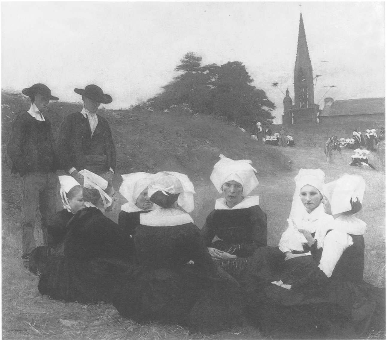
Figure 2. Pascal-Adolphe-Jean Dagnan-Bouveret. Breton Women at a Pardon , 1887. Oil on canvas, 125.1 x 141 cm. Museu Calouste Gulbenkian, Lisbon, inv. 206

introduced by Dagnan's friend Gustave Courtois, whom Dagnan had met while they were art students together in Paris. Dagnan met Walter, a cousin of Courtois, during a visit he made with Courtois to the latter's family home in the Franche-Comté, the area of northeastern France that includes the department of Haute-Saône. After their marriage, Dagnan and Walter often spent time with her family in the same region, and later settled there permanently. 6