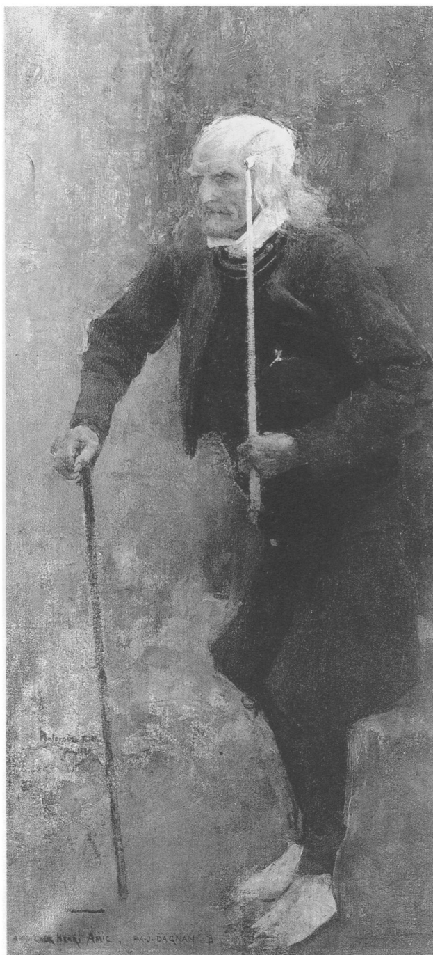
Figure 9. Pascal-Adolphe-Jean Dagnan-Bouveret. Study of an Elderly Breton Man at Pont-Croix , 1886. Oil on canvas, 84 x 41 cm. Musée Jacquemart-André de l'Abbaye Royale de Chaalis, Fontaine-Chaalis, France

An interesting relationship also exists between the Metropolitan painting and a study recently discovered in the Musée Jacquemart-André, Abbaye Royale de Chaalis, near Ermenonville, northeast of Paris (Figure 9). The Chaalis work depicts an elderly man closely related to the one in the Metropolitan picture: each wears the same pardon costume and holds a cane in the right hand, a candle in the left, and a hat in the crook of the left arm. Each is barefoot and elderly, with a wrinkled face and long, sparse white hair. The facial features in the two works may differ, and the figure in the Chaalis study is turned at an angle, unlike the figure in the Metropolitan painting. Dagnan apparently had trouble with this figure, which might explain in part the differences between the study and the final Salon painting. 19