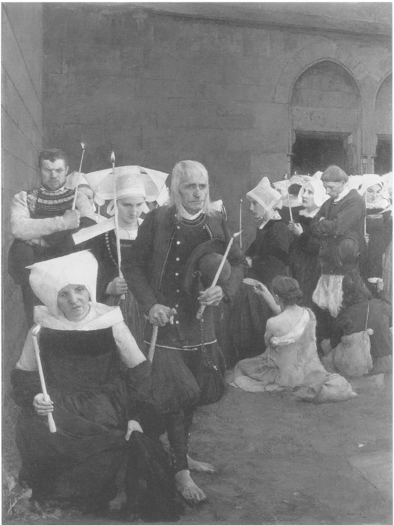
Figure 1. Pascal-Adolphe-Jean Dagnan-Bouveret (French, 1852–1929). The Pardon in Brittany , 1886. Oil on canvas, 114.6 x 84.8 cm. The Metropolitan Museum of Art, Gift of George F. Baker, 1931 (31.132.34). See also Colorplate 5