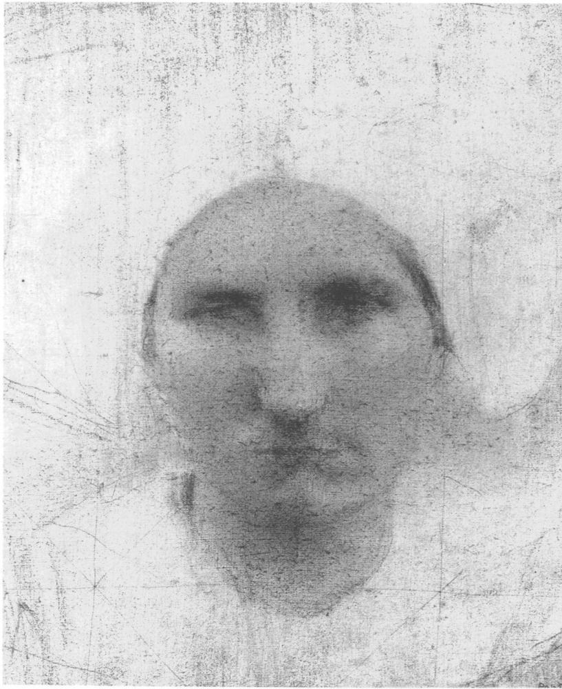
Figure 10. Pascal-Adolphe-Jean Dagnan-Bouveret. Head of a Woman in Breton Costume, 1887. Pastel on canvas (?), 31.5 x 27 cm. Musée Jacquemart-André de l'Abbaye Royale de Chaalis, Fontaine-Chaalis