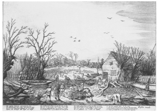
Figure 8. Esias van de Velde (ca. 1590/91–1630). The Great Flood of 1624 . Engraving, 28.3 × 38.9 cm. Amsterdam, Rijksmuseum, Rijksprentenkabinet

shown in lighter colors than those areas saved. The frame is inscribed in a manner later echoed by Saffleven's legend: "Fourteen churches many people and countless houses perished in the fire at Delft; also the town hall and the meat hall 1536." An anonymous woodcut from about 1550 portrays the city of Deventer in profile accompanied by an inscription with historical and topographical information (Figure 7). 21