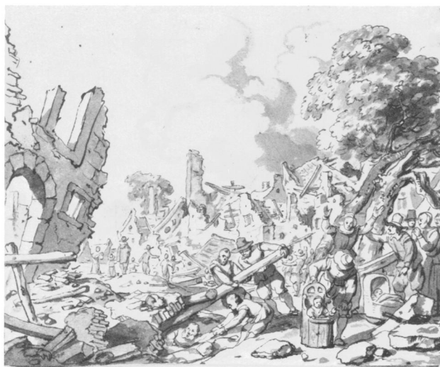
Figure 5. Gerbrand van den Eeckhout (1621–1674). The Gunpowder Explosion in Delft, October 12, 1654 , 1654. Pen and brown ink, gray wash over black chalk, 10.9 × 13.6 cm. Berlin, Staatliche Museen Preussischer Kulturbesitz, Kupferstichkabinett

while others remained standing but no longer had any branches. More than two hundred houses were destroyed and another three hundred lost their roofs and windows. More than one hundred people were killed in the explosion, including the Delft painter Carel Fabritius (1622–1654), and over a thousand citizens were wounded.