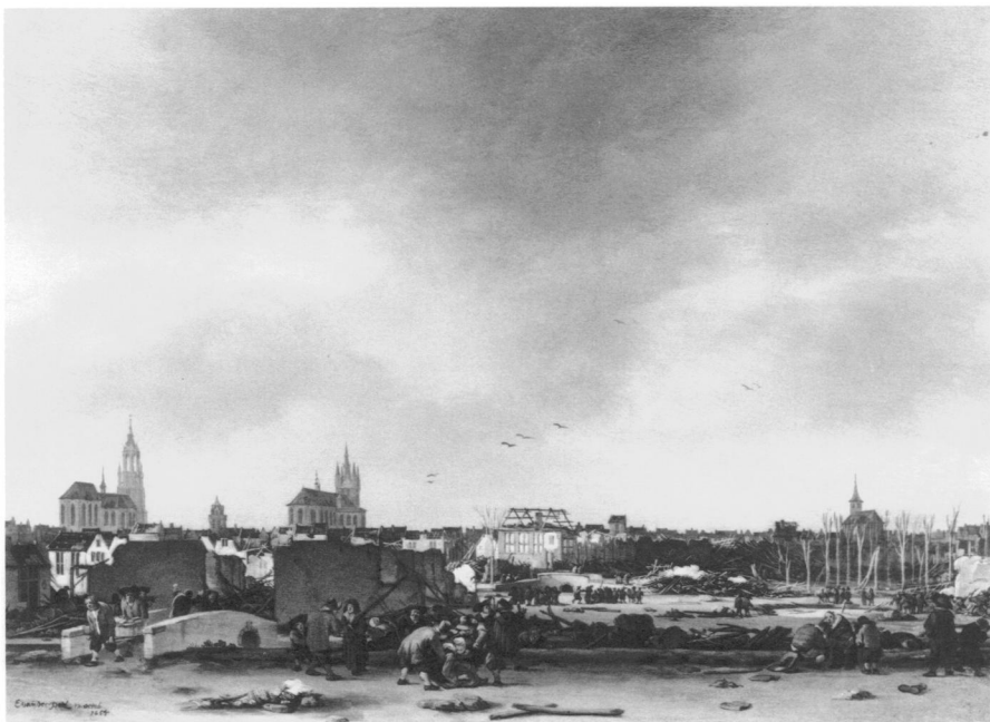
Figure 4. Egbert van der Poel (1621–1664). A View of Delft after the Explosion of 1654 , 1654. Oil on panel, 36.2 × 49.5 cm. London, National Gallery

According to the contemporaneous account that Dirck van Bleyswijck, a Delft burgomaster, provided in his civic eulogy of 1667, Beschryvinge der Stadt Delft , eighty or ninety thousand pounds of gunpowder were stored in the arsenal at the time of the explosion. 14 The thunderous noise was so deafening it was heard on the island of Texel in the North Sea over 120 kilometers away. The powder house was obliterated, leaving only a pool of water fifteen or sixteen feet deep on the site where it stood. Large trees were uprooted