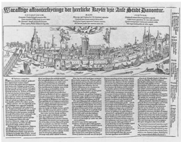
Figure 7. Anonymous. View of the Town of Deventer , ca. 1550. Woodcut, 27.5 × 37.5 cm. Deventer, Gemeentemusea

shown in lighter colors than those areas saved. The frame is inscribed in a manner later echoed by Saffleven's legend: "Fourteen churches many people and countless houses perished in the fire at Delft; also the town hall and the meat hall 1536." An anonymous woodcut from about 1550 portrays the city of Deventer in profile accompanied by an inscription with historical and topographical information (Figure 7). 21