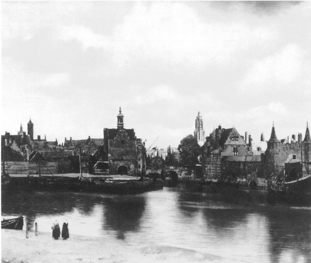
Figure 9. Johannes Vermeer (1632–1675). View of Delft , ca. 1660–61. Oil on canvas, 98 × 117.5 cm. The Hague, Mauritshuis

Other parallels are found in the design of contemporary broadsheets. 22 As the popular vehicle by which religious and political subjects were discussed, wartime victories chronicled, and peace negotiations debated, broadsheets were composed in a way to convey information clearly, with a title, illustration, and text. In rare instances, this format was adapted for other purposes. Esaias van de Velde (ca. 1590/91–1630)