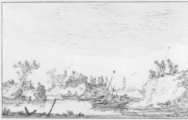
Figure 3. Jan van Goyen (1596–1656). The Break of the St. Anthonis Dike, near Houtewael , 1651. Black chalk, brush and gray wash, 11.4 × 18.4 cm. Amsterdam, Rijksmuseum, Rijksprentenkabinet

describe the site of the devastation but, unlike his contemporaries, he treated his subject on a much grander scale.