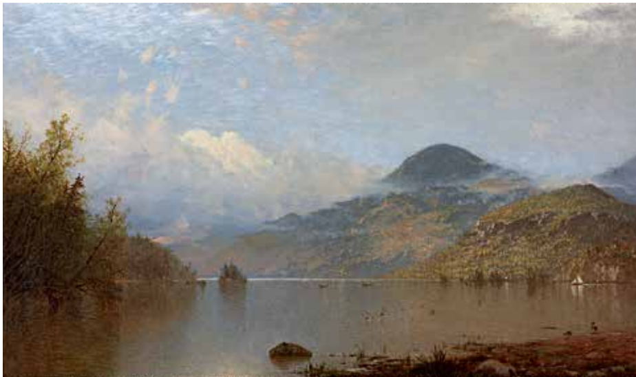
5. John Frederick Kensett. Black Mountain, Lake George , n.d. Oil on canvas, 14 \frac{1}{8} x 24 in. (35.9 x 61 cm). Museum of Art, Rhode Island School of Design, Providence, Gift of Jesse H. Metcalf (20.029).