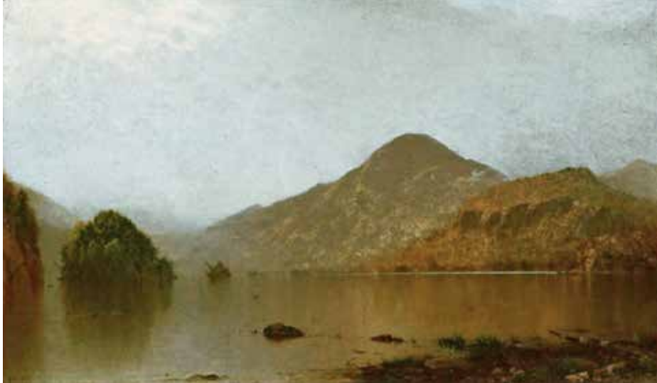
4. John Frederick Kensett. Lake George, 1872. Oil on canvas, 12 x 24 in. (30.5 x 61 cm). Private collection.