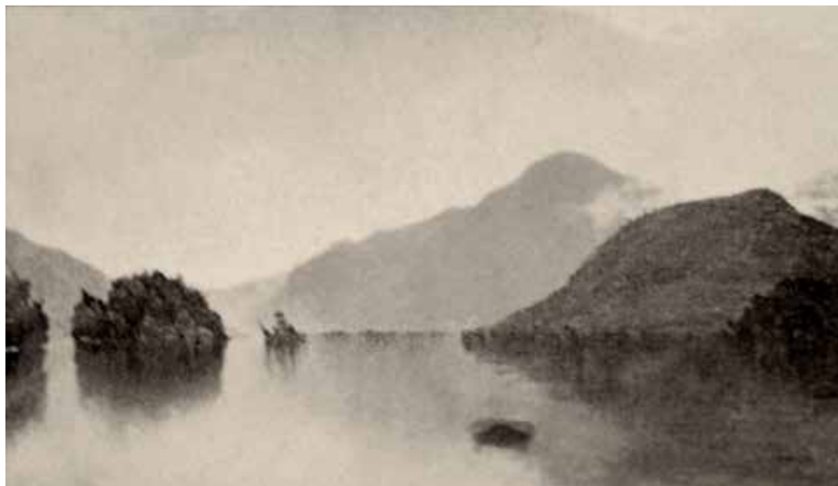
6. John Frederick Kensett. Lake George , n.d., 13 \frac{3}{4} x 23 \frac{3}{4} in. (34.9 x 60.3 cm). Location unknown. From Kensett Estate Sale Album 1873, pl. 5