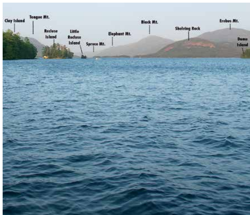
3. Perspective of Lake George from the east side of Homer Point looking to the northeast.

Metropolitan painting, Kensett made Black Mountain appear even more imposing; he introduced an element of the Sublime by suggesting a tremendous vertical drop from the peak in place of the mountain's actual leftward sloping ridges and slight concavity at the top.