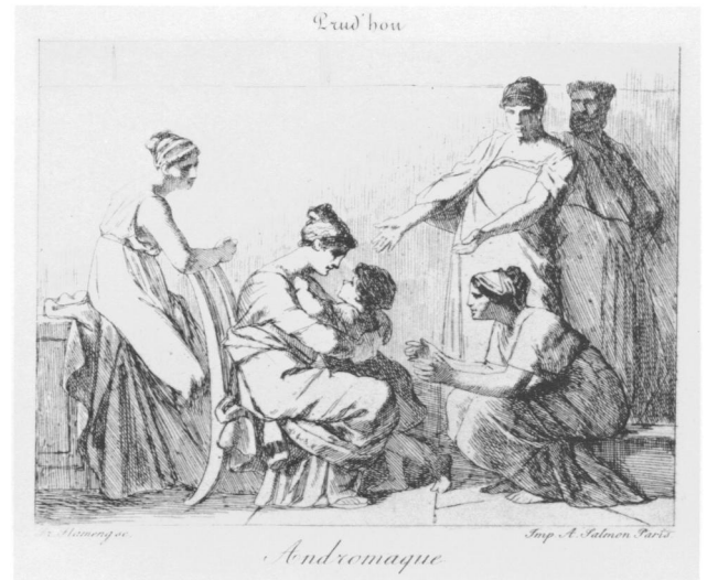
3. After Prud'hon, Andromaque , engraving of a compositional study for Andromache and Astyanax , from Catalogue . . . collection Laurent-Richard (Paris, 1878) facing p. 109. The Metropolitan Museum of Art, Thomas J. Watson Library