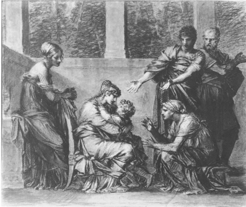
2. Prud'hon, Andromache and Astyanax . Black chalk heightened with white on blue prepared paper, 14\frac{3}{4} \times 17\frac{7}{8} in. (37.5 × 45.5 cm.). Paris, Musée du Louvre, Cabinet des Dessins